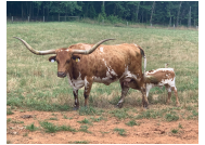
BOWL OF ROSES