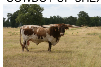
COWBOY UP CHEX