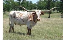
POCO LADY BL