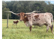
HORSESHOE J CADENCE