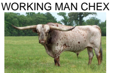
WORKING MAN CHEX