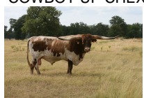
COWBOY UP CHEX