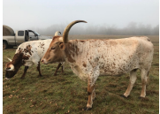
Horseshoe J Pancake 546