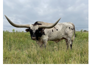
BL RIO CATCHIT