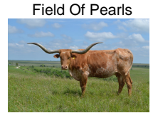
Field Of Pearls