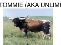
VJ TOMMIE (AKA UNLIMITED)