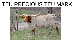
TEU PRECIOUS TEU MARK