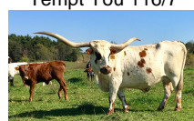
Tempt You 116/7