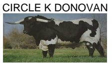
CIRCLE K DONOVAN