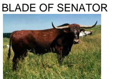
BLADE OF SENATOR