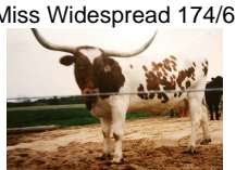
Miss Widespread 174/61