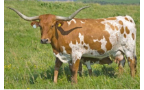
FIELD OF ROSES