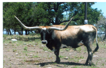
BL Wind Dancer