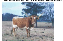
Double J Miss Butler