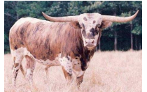
ACE'S DAYTON DESPERADO