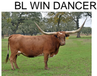
BL WIN DANCER

Total Horn: 101.0000 on 04/21/2022 TTT: 73.5000 on 01/31/2023 Right Base: 13.0000 on 11/13/2020 Base: 13.7500 on 12/05/2019 Weight: 1185.0000 on 10/06/2022 Composite: 180.2500 on 11/13/2020