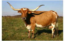
MY MY MY