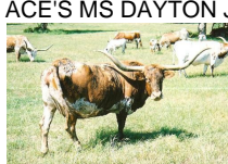
ACE'S MS DAYTON J