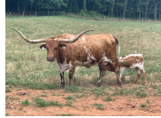
BOWL OF ROSES