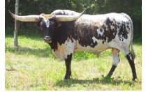
Horseshoe J Charm