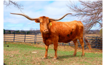
BL Coach's Desperado