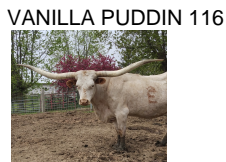
VANILLA PUDDIN 116