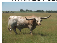
TITAN EOT 8E8