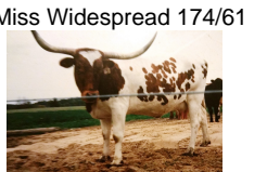
Miss Widespread 174/61