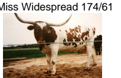
Miss Widespread 174/61