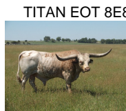
TITAN EOT 8E8