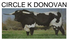
CIRCLE K DONOVAN