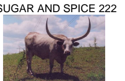
SUGAR AND SPICE 222