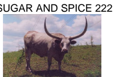
SUGAR AND SPICE 222