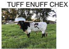
TUFF ENUFF CHEX