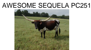
AWESOME SEQUELA PC251