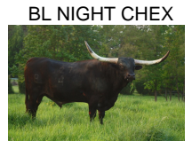
BL NIGHT CHEX