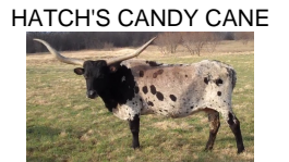
HATCH'S CANDY CANE